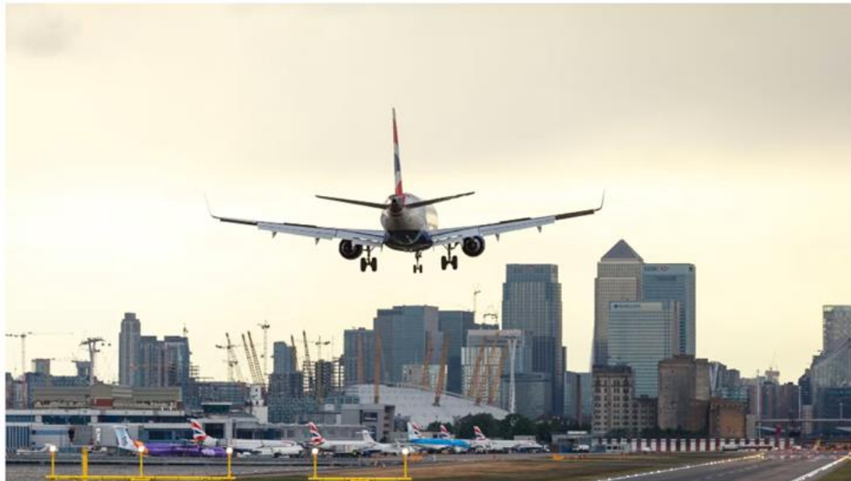
The non-profits argue that allowing ships and planes running on fossil fuels to be aligned with the green taxonomy undermines the whole purpose of the mechanism ©